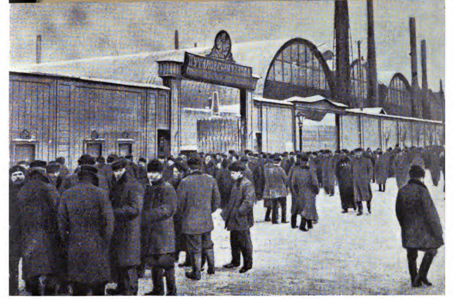
STRIKE AT THE PUTILOV MILLS, 1905